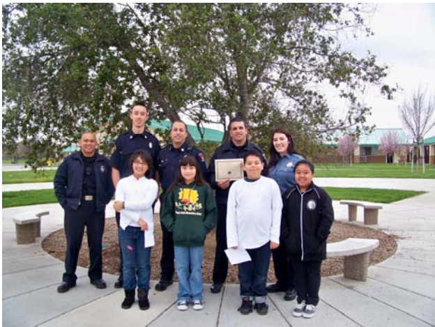
Canyon Oaks Elementary School