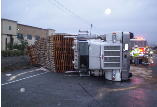
Overturned Truck on Hwy 29